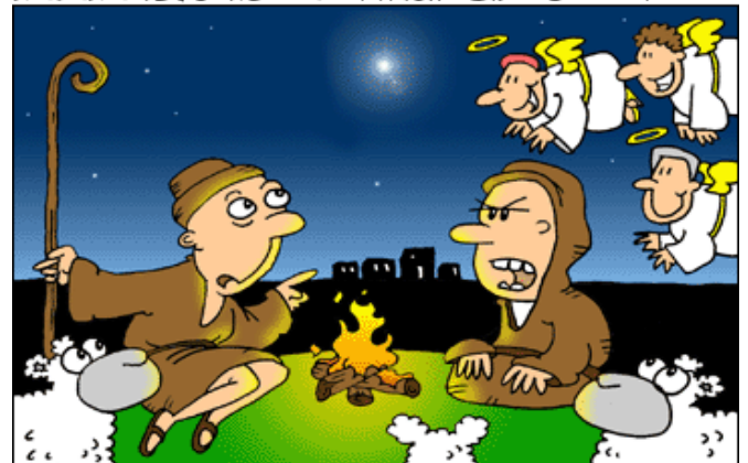
Thanks to Mikel Rice (See Luke 2:1-16)